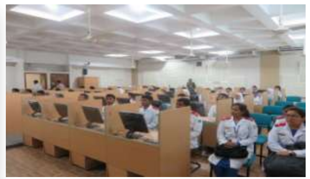
English Language Lab

13. Lab & Museum. All Colleges have required number of practical labs named Physiology Lab, Bio-chemistry Lab, Histology Lab, Dissection Hall and Museum, Forensic and Community Medicine Lab for practical classes.